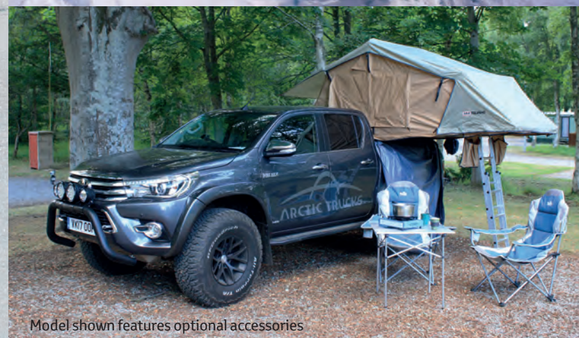
Model shown features optional accessories

You don't need to be a polar explorer to own an Arctic Truck. Our vehicles are equally at home in the wilds of the countryside, desert or city.