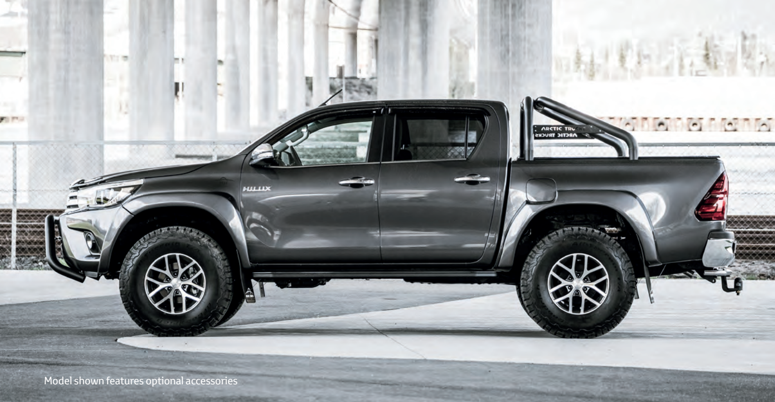
Model shown features optional accessories