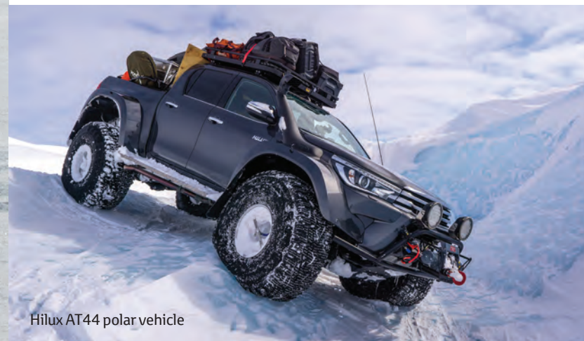
Hilux AT44 polar vehicle