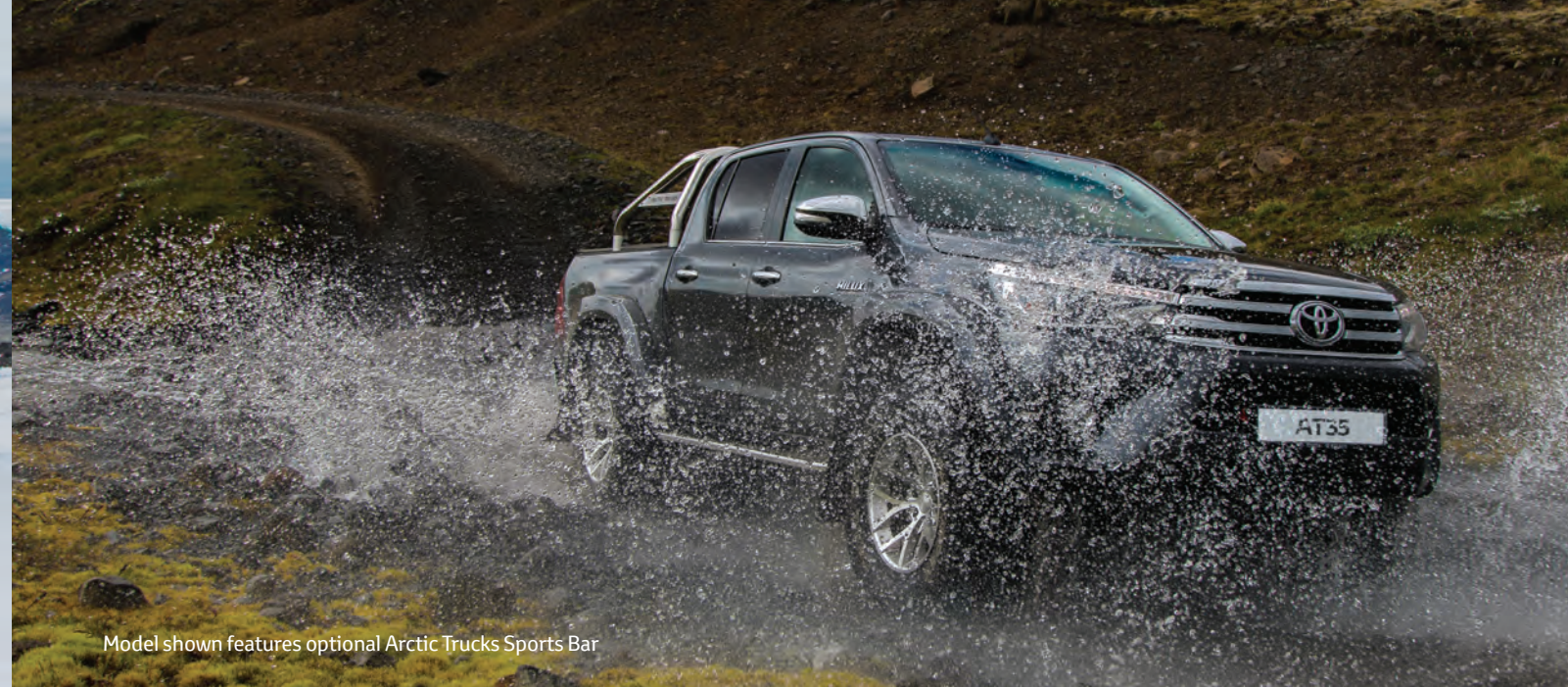
Model shown features optional Arctic Trucks Sports Bar

The Toyota Hilux Arctic Trucks AT35 is fitted with 35" tyres on 17x10 wheels. We have also upgraded and raised the suspension by 40mm. This provides higher ground clearance, better traction, a smoother ride and higher all-round visibility.