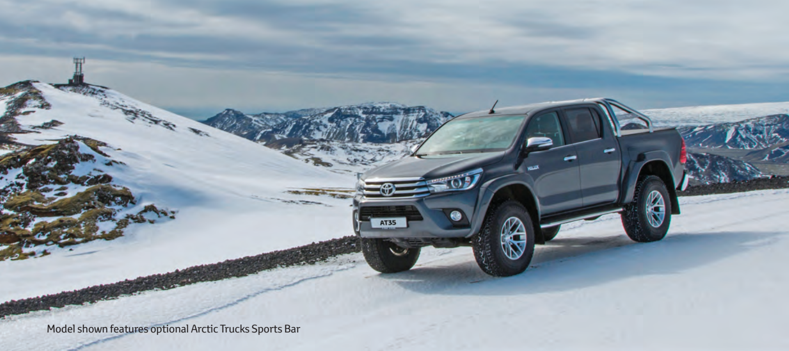
Model shown features optional Arctic Trucks Sports Bar