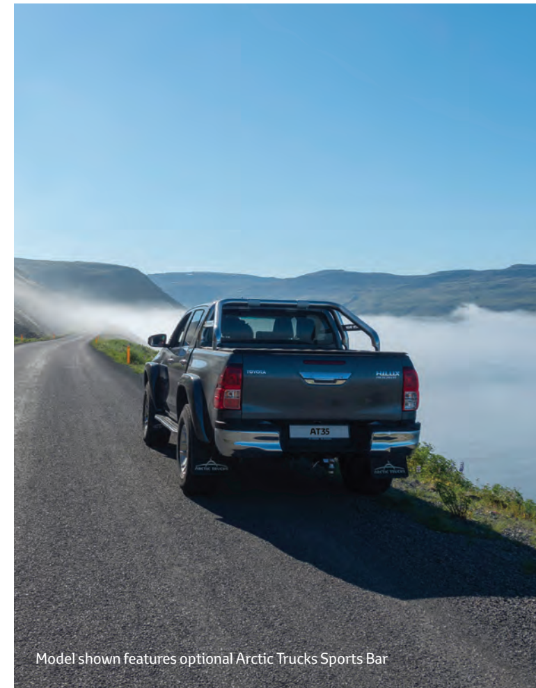
Model shown features optional Arctic Trucks Sports Bar

In other words, we have tamed environments others simply do not account for.