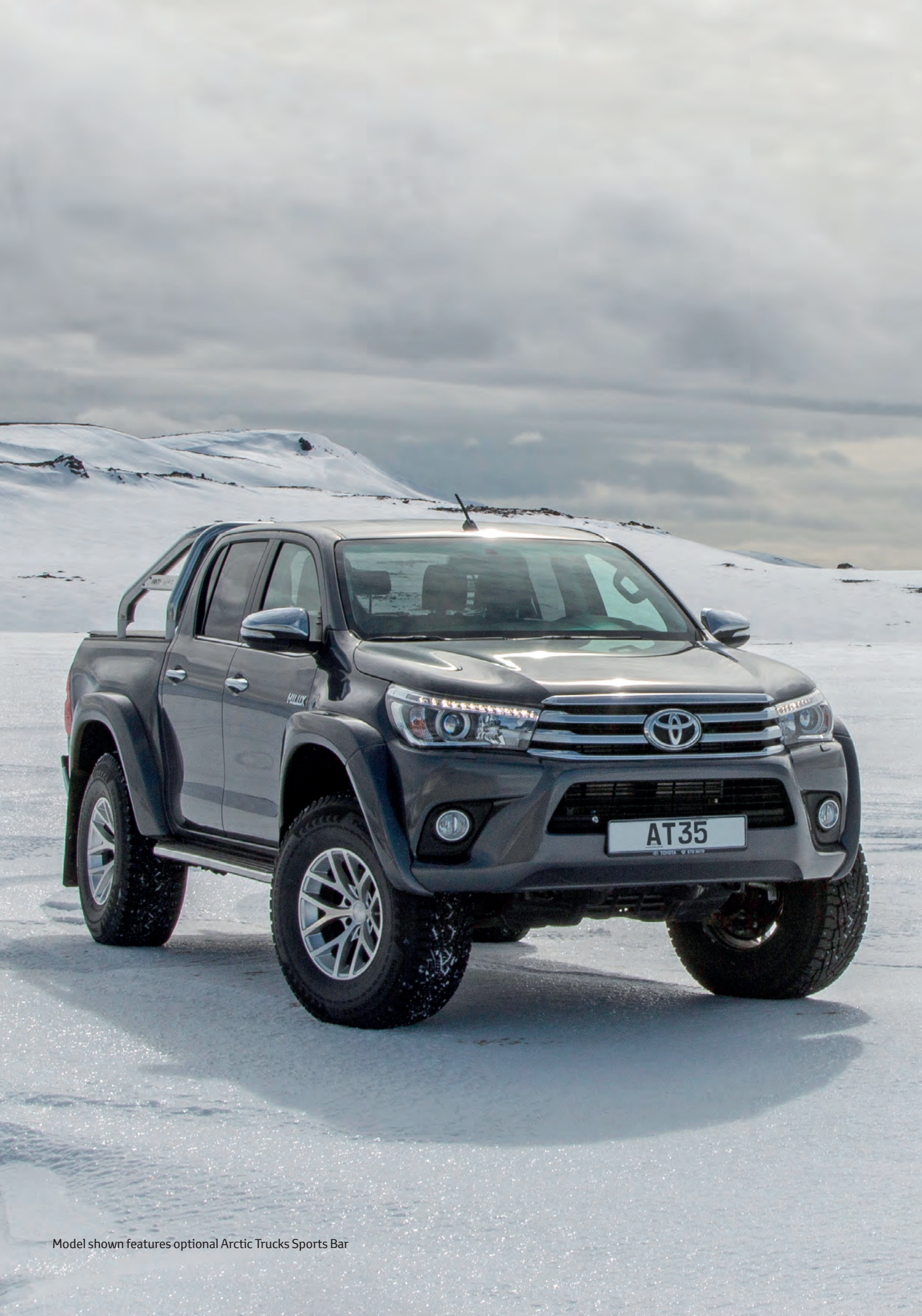
Model shown features optional Arctic Trucks Sports Bar